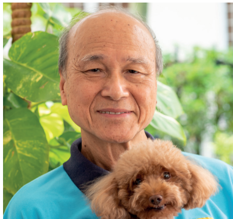
Tan Sri Lee Lam Thye Patron, SPCA SELANGOR

Warmest greetings to all animal lovers, hope all will stay healthy as we continue to ride out the Covid 19 pandemic.