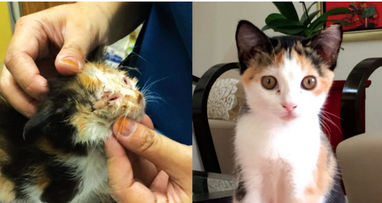
My rescued kitten Kelly: before & after

It is not only until recently, about 10 year ago, that the idea of neutering became popular. I began embracing the idea whole-heartedly. I can see the value in neutering to purposefully reduce the stray population, be it for dogs or cats. I have been actively rescuing and neutering cats since then. To date, I have more than 10 stray cats that I had rescued and neutered. They were