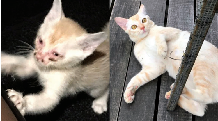
My rescued kitten Maebe: before & after

rescued from the market that I frequented, from the roadside that I passed and even from restaurants that I visited to satisfy my gastronomic cravings. My first intention when rescuing these strays was to neuter and put them up for adoption. However, it had been a hard process on my 2 children. My children ended up loving them and in the end, I caved in to my children's pleas and the strays mostly ended up staying.