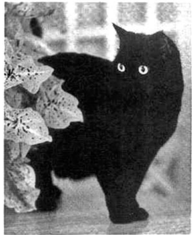
From above: Mrs. Bush with her loved spaniel, Spot; sun-loving India; Barney, the social Scottie.